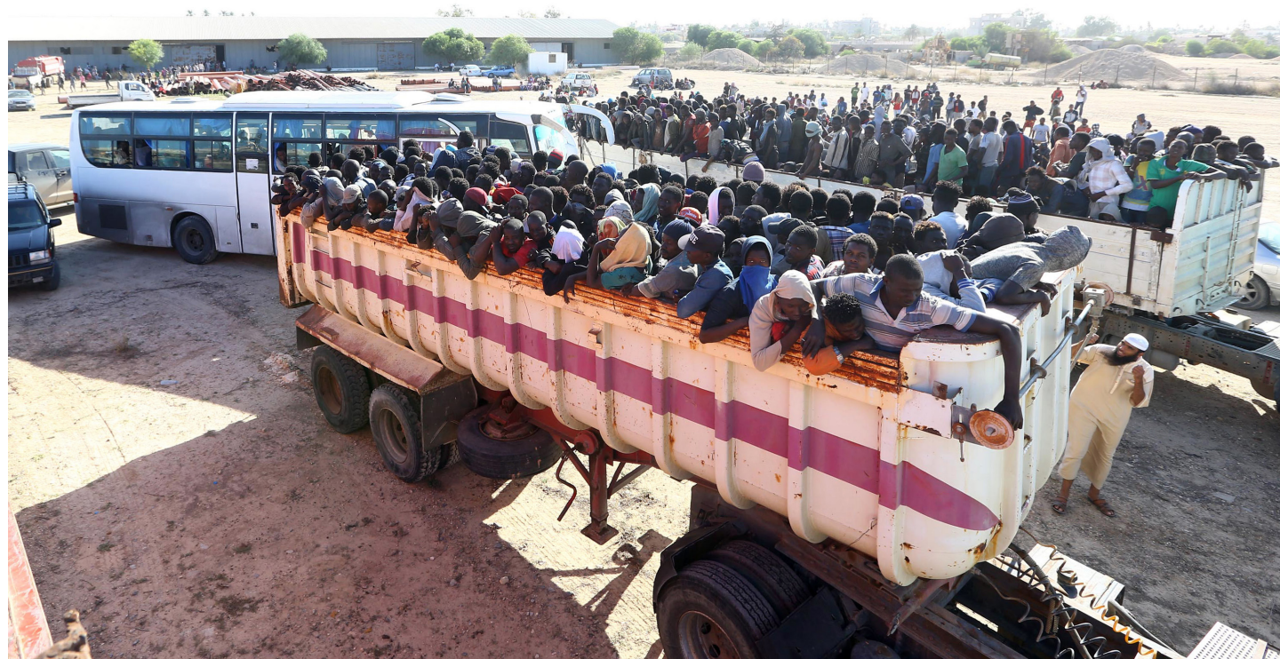
Detained migrants in Sabratha, Libya being moved to shelters in October 2017.

How governments adapt to changing migration dynamics carries risks and challenges. The migration debate in the Maghreb is set against a social-political backdrop in which every regional government is grappling with some level of domestic protest stemming from socioeconomic grievances and unmet expectations of change. Youth unemployment has reached 21.0 percent in Morocco, 29.1 percent in Algeria, and 35.4 percent in Tunisia; 87 prices for basic goods are increasing; and public services are not meeting the needs and expect-