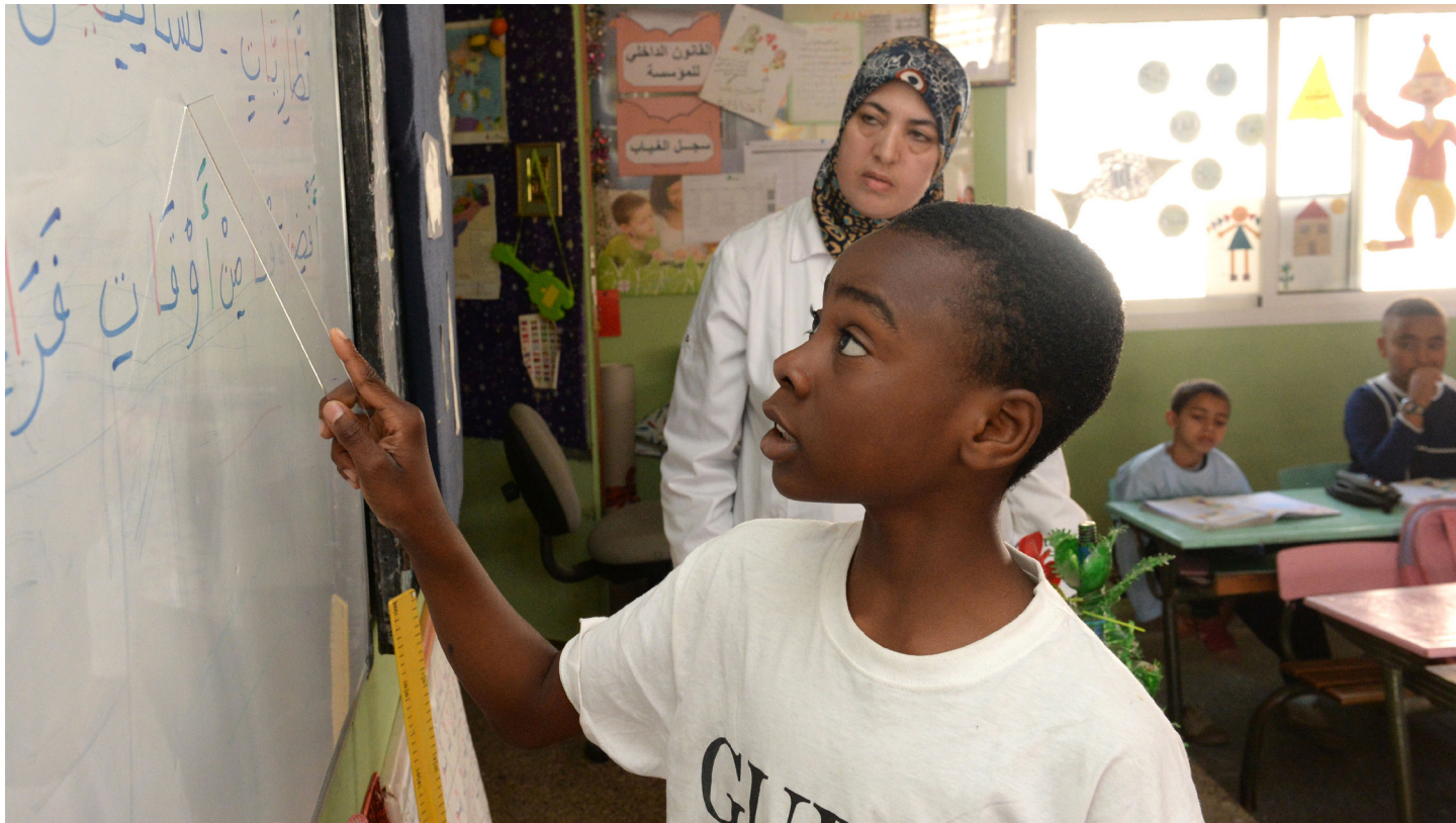
A young sub-Saharan migrant attends Arabic class at a school in the Moroccan capital Rabat in May 2014.