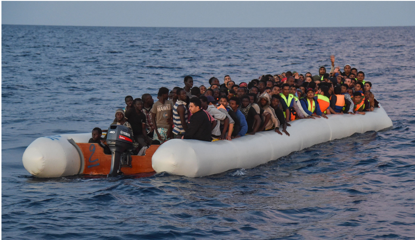
Migrants off the coast of Libya in November 2016.