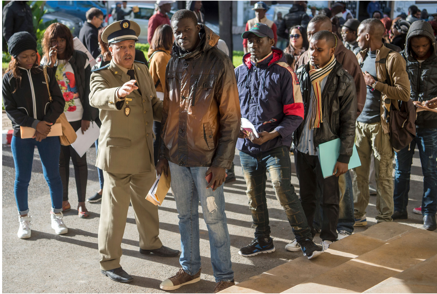
A Moroccan official directs migrants applying for regularization in Rabat in December 2016.