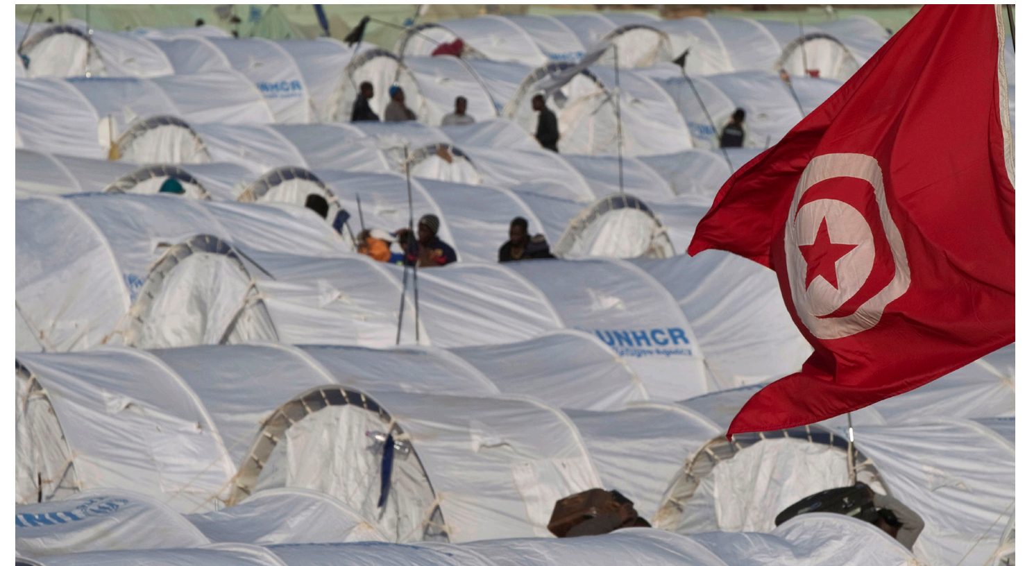
A Tunisian flag flies above the Choucha refugee camp near the Libyan border in March 2011.

Fifth, the extent of Maghreb governments' willingness to enforce stricter policies preventing irregular migration